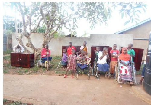
Children are looking at the cupboards or the dormitoriess

The children have returned from their holidays and are all working hard for the end of year exams which they have to pass before they can move up to the next class. There are 4 boy and 2 girls in the top class at primary school so will be moving to secondary school at the beginning of the next school year in January. If any of them are in the top10 of the class we will allow them to sit the en-trance exam for Hegongo secondary school, the private school run by the church, and if they pass we find a sponsor to pay for them as the teaching is much better and the classes are smaller than in the local secondary school. The main rains this year were better than they have been for the last few years so the Centre has been able to use the harvested water for most of the year which was useful as the main supplying the village has been damaged and turned off until it could be repaired. We hope that when all the harvest is gathered it will be better than last year. So far they have only harvested the corn and yield was poor but only a small area was planted because of starting crop rotation and the other divided areas have still to harvest pigeon peas and cassava. If the short rains come at the end of the month the Centre can plant again and harvest before the rains in March/April.